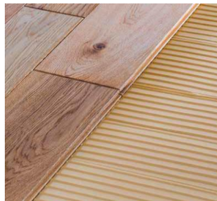
Picture 3. Clean Spills